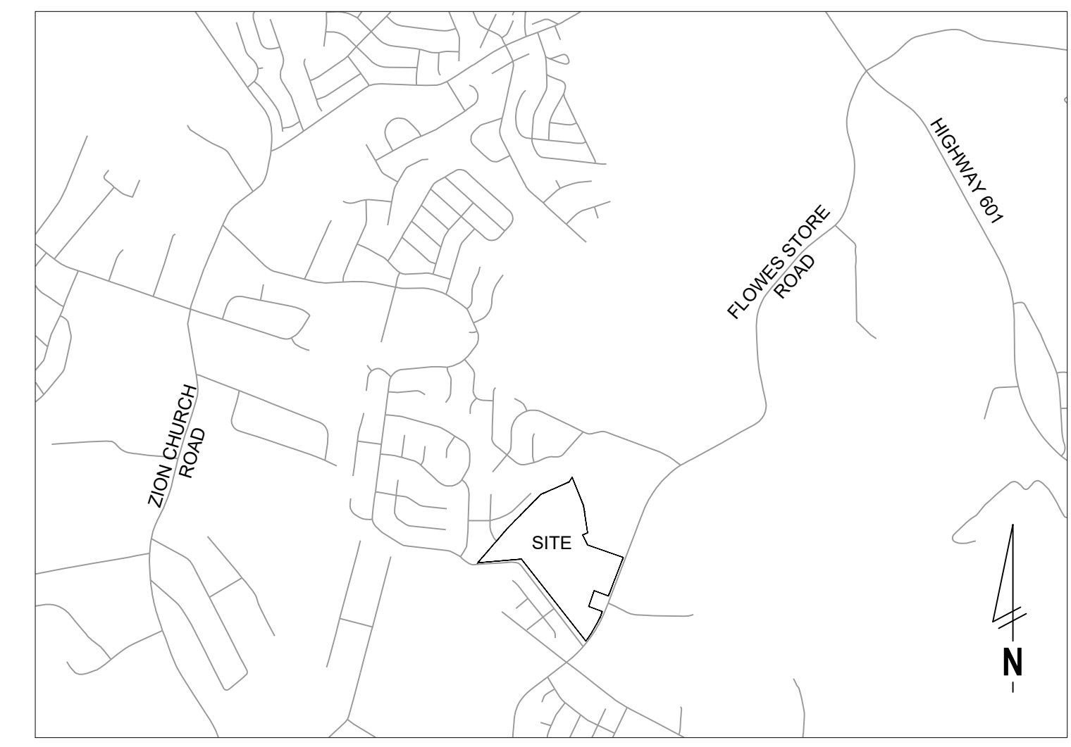
LOCATION MAP SCALE: 1" = 2,000'