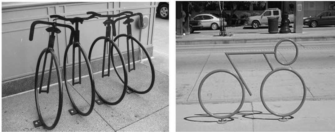
Images: Examples of Alternative Bicycle Rack Designs