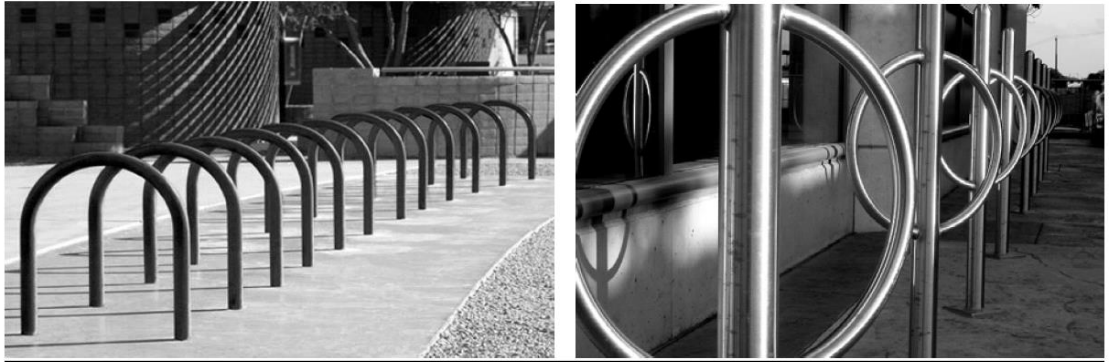
Images: Examples of Standard Bicycle Rack Designs